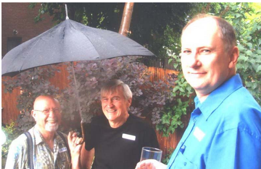
Summer BBQ - Whose Cooking?