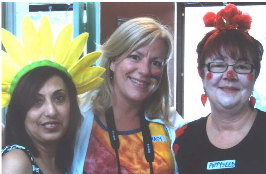
Summer BBQ - Painted Ladies!