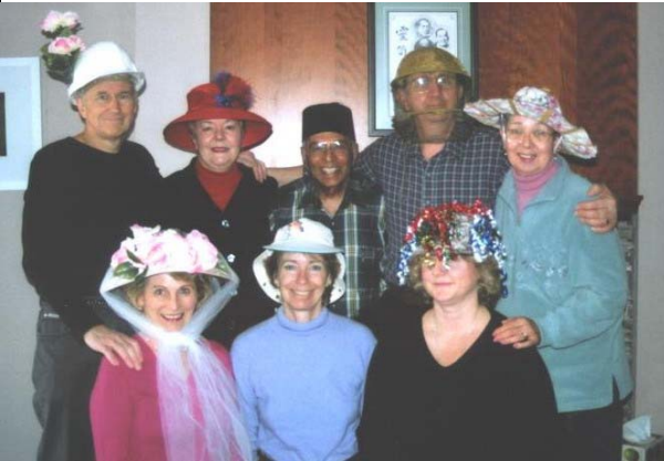
Mad Hatters Garden Party—2005

The Summer of 2006 promises to be another Adventure in the Garden...so get out those gardening gloves...it's not that far away. THINK S-U-N = W-A-R-M-T-H