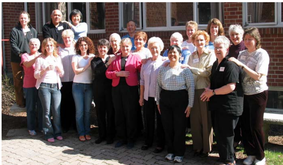
St. James United Church April 2005 Reiki I Class